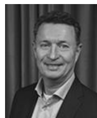
Sverker Härd Swedish Agency for Cultural Policy Analysis