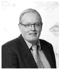
Björn Risinger Swedish Environmental Protection Agency