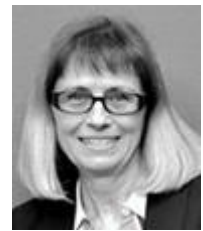
Carina Gunnarsson National Mediation Office